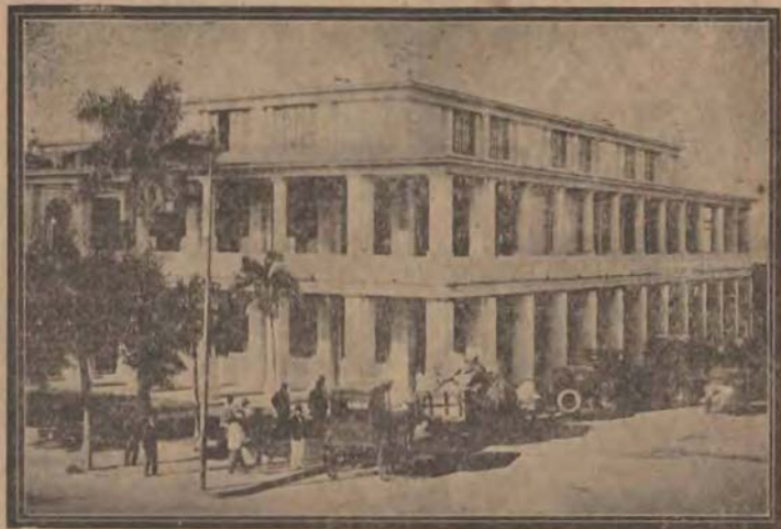
GENERAL POST OFFICE, KINGSTON