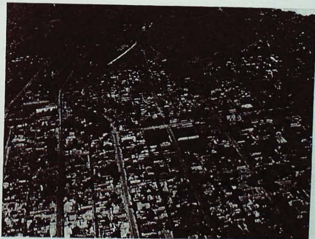
KINGSTON FROM THE AIR