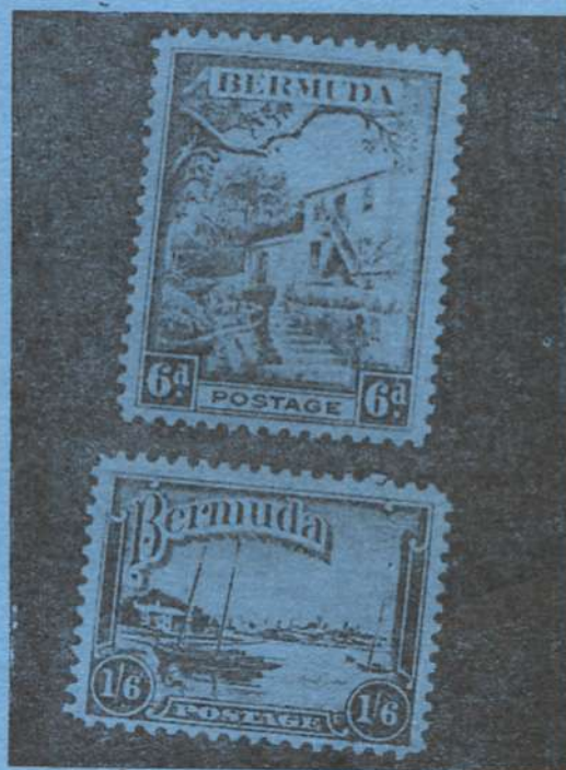
Type 6 and 7