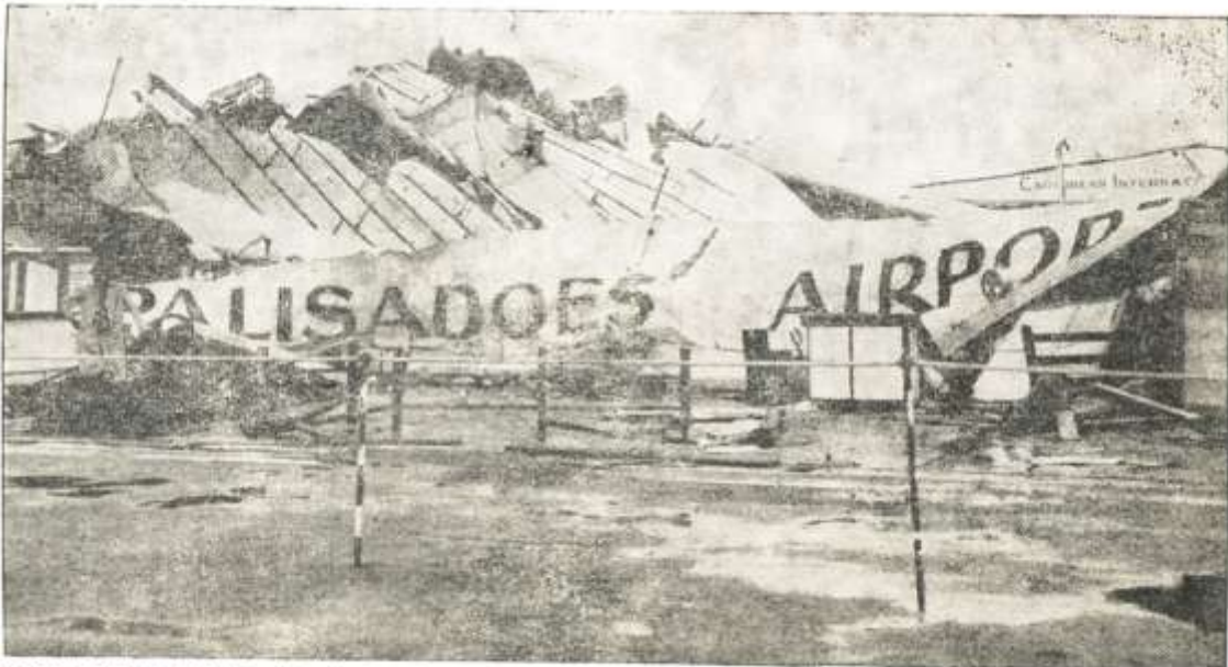
PALISADOES AIRPORT after the hurricane of August 17—During the night 17" of rain fell with the wind recording of 160 m.p.h. The Palisadoes Post Office had been closed until December 22.

Electric and Telephone lines, also telegraph poles were badly broken. The G.P.O. pushed into service Trucks and Buses to distribute mail to the country parts, while a privately owned plane dropped the Daily Gleaner in the more isolated points. No cachets were used.