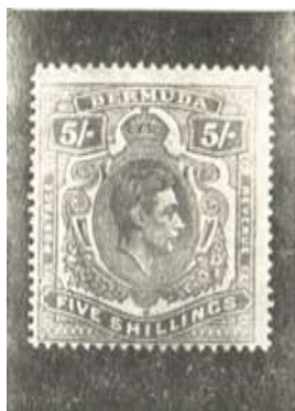
Types — 7

20th January 1938 head of King George VI. Typographed De La Rue & Co Wmk Mult. Script CA Perf. 14