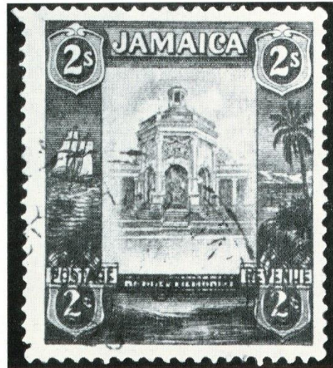
Lot 349 The rarest West Indian error.

At the Auction Rooms of Robson Lowe Ltd. 50 Pall Mall, London, ABBEY 4034-5 S.W.1